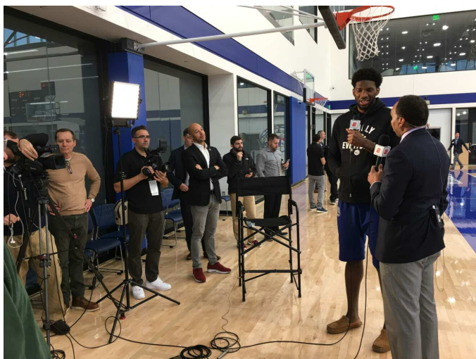
We had ESPN's Philadelphia All Access Day covered with Stephen A. Smith and Joel Embiid of the 76ers.