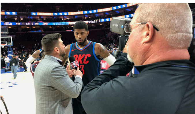
Courtside with Jared Greenberg's postgame interview with Paul George for NBA TV.