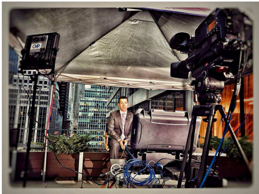
We're with NFL Network's Ian Rapoport all season for the latest news and information.