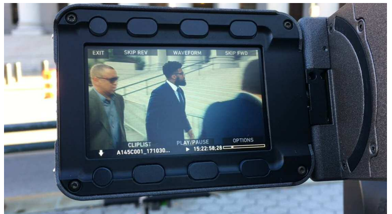
Dallas Cowboy Ezekiel Elliott arrives at NFL HQ for his hearing.