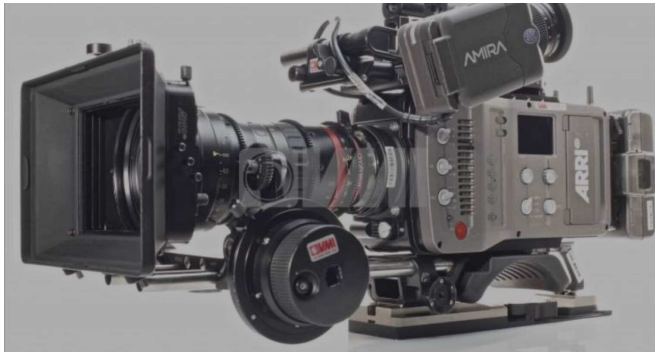
ARRI Amira 4K HD Camera with Prime Lenses

OVP Productions has equipment to meet all your video production needs. We continuously update our gear to keep pace with evolving technology and proudly offer our clients the latest state of the art equipment available today.