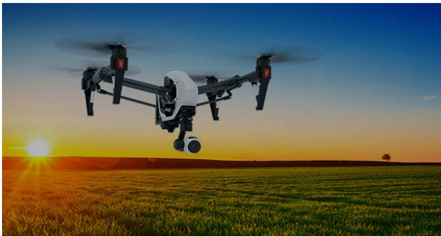
DJI UAV Inspire One

The state of the art unmanned aerial vehicle captures amazing photographs and video enabling aerial views like never before. Capture high resolution photos and videos up to 300 feet to get the perfect shot at the precise height and location.