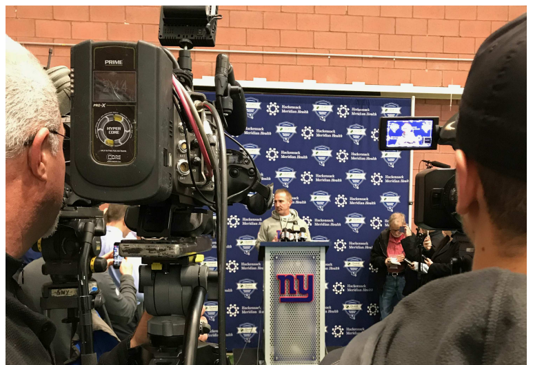
Steve Spagnuolo takes the helm as Giants head coach.