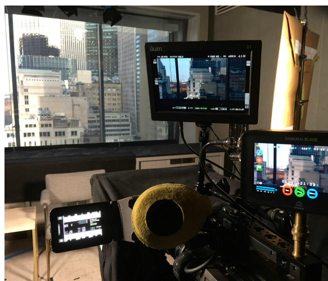
The ARRI Amira and Prime lenses were the perfect choice for our NBA Entertainment shoot with Commissioner Adam Silver in New York City.