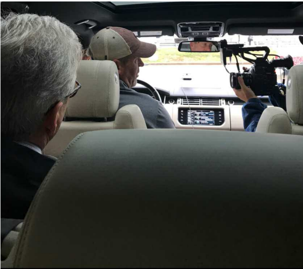
Riding along for an exclusive with Eagles Head Coach Doug Pederson and Sal Paolantonio en route to Lincoln Financial Field before kickoff.