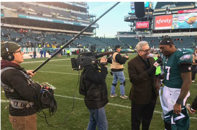
We made sure Sal Paolantonio got an ESPN postgame interview with Alshon Jeffery on the field after the Eagles win another one.