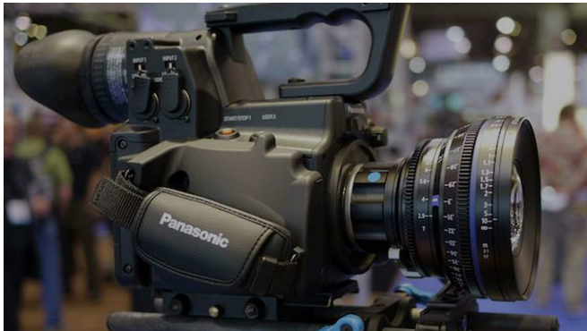
Panasonic AF100 with Prime Lenses