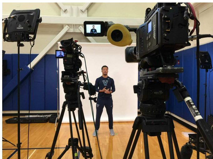
Spent the day at Villanova shooting college hoops promos for ESPN with Jalen Brunson, Coach Jay Wright and more.