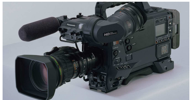
Panasonic HDX900 HD Cameras