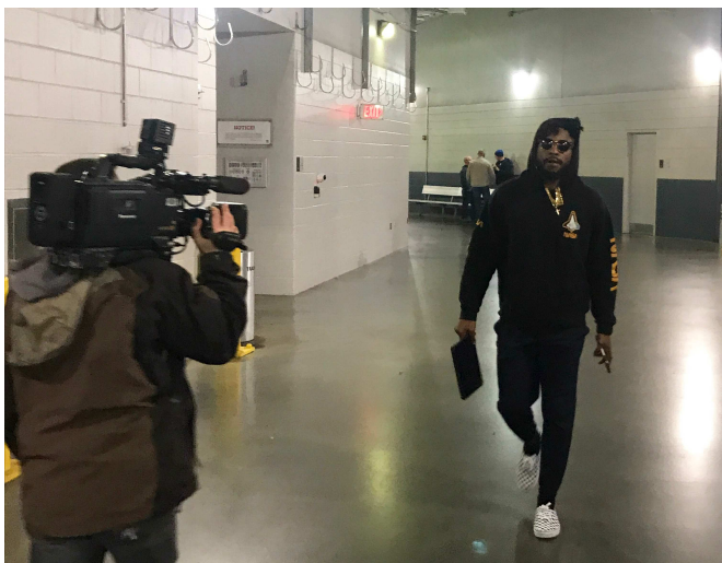
Giants' Landon Collins arrival to the stadium as captured by Ian.