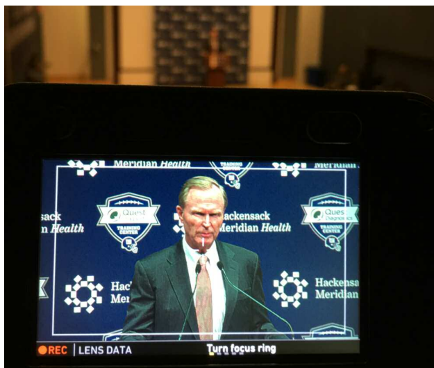
When an NFL team makes changes during the season, you've got to be ready to react. Covering John Mara Giants presser for the NFL Network after Ben McAdoo and Jerry Reese firings.