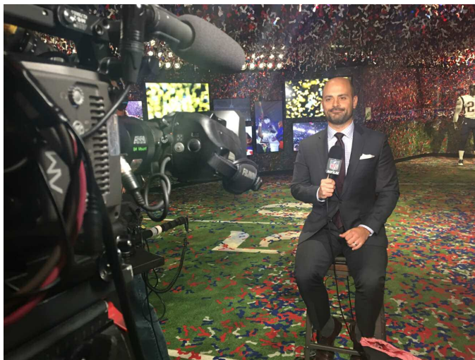
Mike Garafolo of NFL Network after confetti drop at opening of the new NFL Experience.