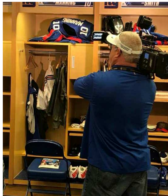
Bob shoots pregame elements in Giants locker room for NFL Network.