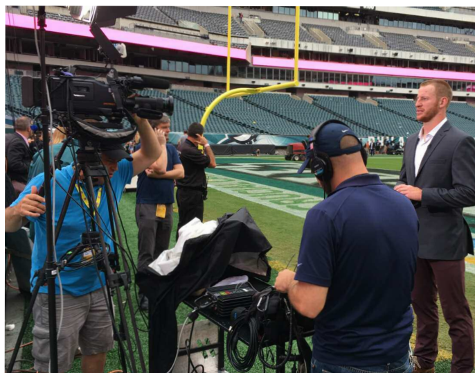
Standing by with Carson Wentz for his ESPN postgame talk-back.