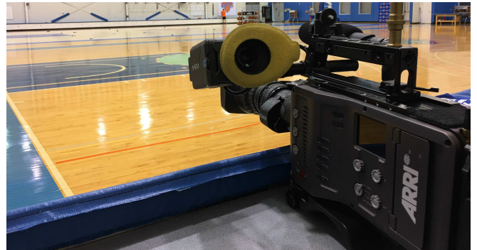
Here's the ARRI ready to capture basketball.