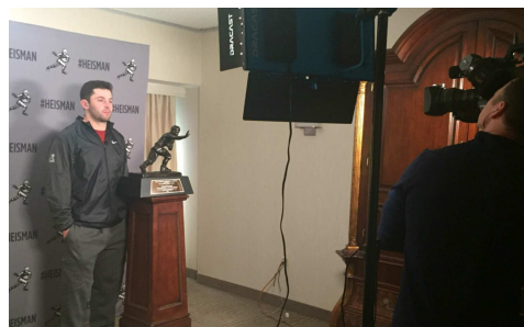
The morning after Baker Mayfield won the Heisman, we were ready for his ESPN interview with Hannah Storm.