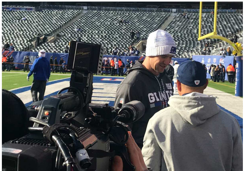
One week after not starting his first ever game as a NY Giants QB, Eli Manning was back on the field getting ready for the Cowboys.