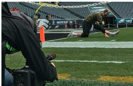
We caught Eagles QB Carson Wentz pregame stretch on the field.