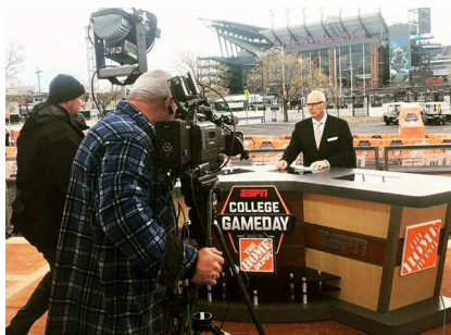
All set for ESPN College Gameday with Gene Wojciechowski.